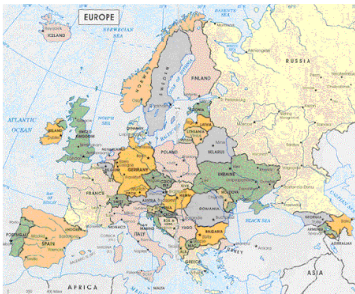
FIG. 1. Location of Sweden in Europe.

Sweden is a long narrow country in the northern part of Europe and borders Norway in the west, Finland in the northeast and the Baltic Sea in the South and east, as shown in Figure 1. The total length from north to south is 1,600 kilometres and the land area is 410,932 square kilometres. The size of the area is the third in Western Europe after France and Spain. The area is almost twice as big as that of Great Britain. The northwest part of Sweden consists of mountains with a slope towards the east. There are many rivers in the north and lakes are scattered all over the country. Sweden's coast line is more than 2,000 kilometres long.